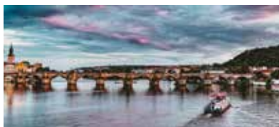
PRAGUE, CZECH REPUBLIC Journalism and Electronic Media