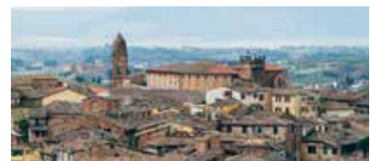
SIENA, ITALY Public Relations