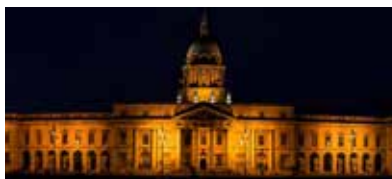
DUBLIN, IRELAND Communication Studies