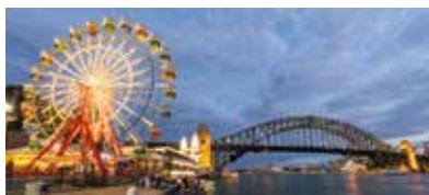
SYDNEY, AUSTRALIA CCI

Experiences like these change lives and enhance career options in many ways. With today's increasingly interdependent world, the significant cross-cultural experience is often what employers and graduate schools seek.