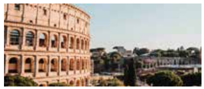
ROME, ITALY Advertising